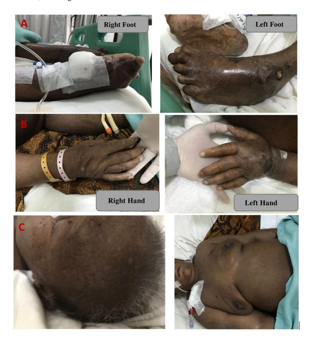
Figure 1. Multiple diffuse hyperpigmented macules were demarcated, geographically shaped, and covered by thin scales and xerotic scars in the head, thoracal, abdominal, and extremities area.

limits. The abdominal were ascites. Multiple diffuse hyperpigmented macules were demarcated, geographically shaped, and covered by thin scales and xerotic scars in the thoracal, abdominal, and extremities area (Figure 1.).