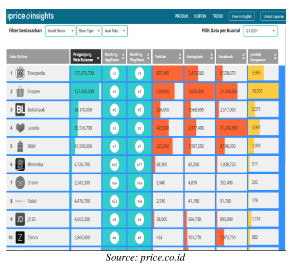
Figure 1. Marketplace Competition in Indonesia First Quarter 2021

Tokopedia is one of several ecommerce sites in Indonesia. Tokopedia provides a place for sellers and buyers to buy and sell products for free without being charged any fees. Tokopedia Indonesian technology company with a mission to achieve economic equality digitally. Since its founding in 2009, Tokopedia has transformed into a unicorn influential in Indonesia and Southeast Asia. Tokopedia has the leading marketplace business in Indonesia that individuals, small shops, and brands to open and manage online stores. Tokopedia is not only a buying and selling website but also an online store provider that has maximum service to its consumers. The concept of this website is to provide seamless service to its customers.