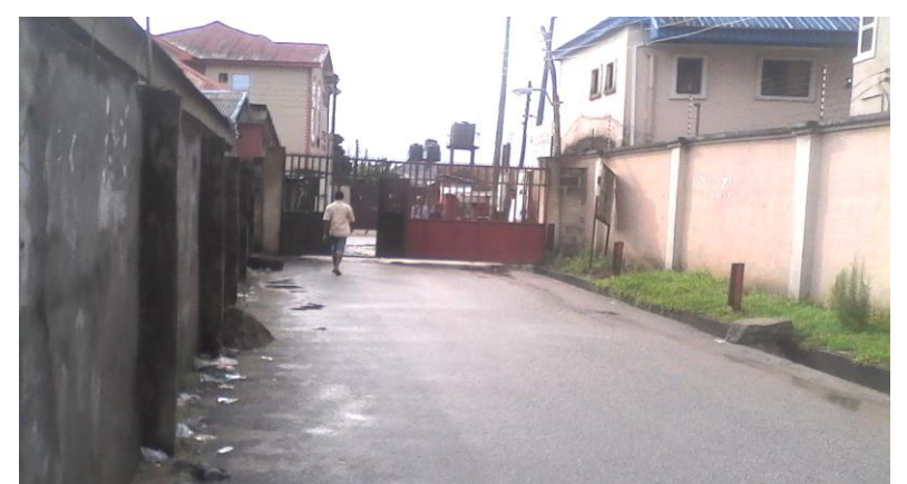
Plate 4.2: Showing Use of Security Gates Across a Street Entrance