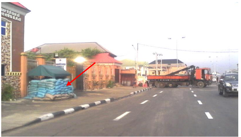
Plate 4.1: Showing Use of Security Booths

The study revealed that 34% of the respondents are not aware of the presence of a police facility in their neighbourhood, though they consider their neighbourhood as being safe. Given that gated communities are few in the study area, many of the respondents depend on local vigilantes (non-state actors) for security. Although 32.9% depend on the Nigerian Police (state actors) for security, Police response to crime was rated effective (33.1%), not effective (23.5%), very ineffective (17.9%), very effective (10.6%) and undecided (14.9%). On government handling of security issues and crime-fighting, 14.9% residents were very positive, 34.3% say government response is quite positive, 43.6% were undecided, very few residents, 2.2% express very negative sentiments while 5.0% were quite negative. It means that most residents are indifferent to the Government handling of the security situation.