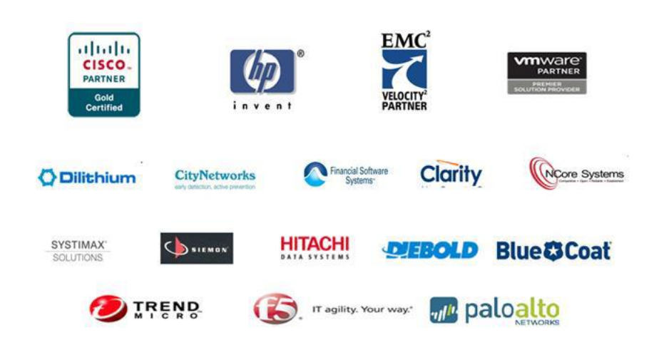
Figure 4.1 Main ICT Vendor/Supplier of PT XYZ

Until now PT XYZ has developed the capabilities of experts and obtained certification from several major IT vendors in the world today. The close relationship between PT XYZ and Cisco, and other vendors, enables PT XYZ to expand support and service for customer needs and satisfaction. Here are some of the world's major ICT vendor partners: