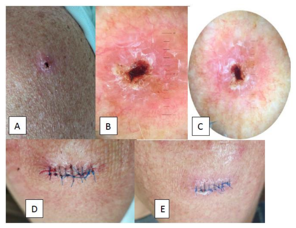
Figure 1. Basal cell carcinoma lesions before and after wide excision A. Macroscopic of basal cell carcinoma, B and C. Dermoscopy of basal cell carcinoma C. After wide excision D. After 2 weeks wide excision

subjected to standard excision suggest under local anesthesia. The histopathological results confirmed that the lump that the patient complained about was a mixed type of basal cell carcinoma (Figure 2). The post wide excision wound was closed with both outer and inner sutures. After 2 weeks, the patient came back to the clinic to remove the stitches, and it looked dry, without any signs of infection. Patients were also required to re-evaluate within 6 months, to prevent the appearance of other skin malignancies.