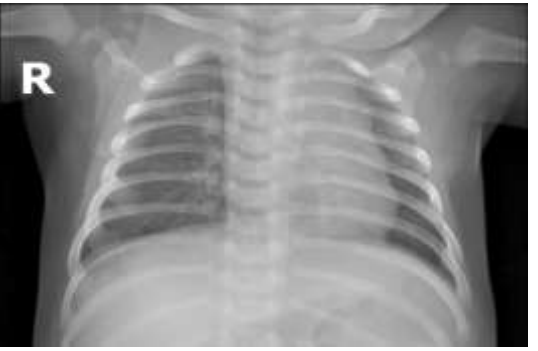
Figure 1. Chest X-ray shows widening of upper mediastinum space.

examination revealed white blood cells 20.07 \times 10^{3}/\mu L , neutrophils 18.41 \times 10^{3}/\mu L (91.74%), lymphocytes 1.18 x 10^3/\mu L (5.86%), haemoglobin 10.71 g/dL, MCV 91.35 fL, MCH 27.81 pg, MCHC 30.44 g/dL, haematocrit 35.19%, RDW 13.09%, platelet 413.5 x 10<sup>3</sup>/µL. Blood gas analysis revealed pH 7.39, pCO2 58.1 mmHg, pO2 185.60 mmHg, BEecf 9.1 mmol/L, HCO3-34.1 mmol/L, SO2c 99.2%, TCO2 35.90. Electrolyte serum revealed Natrium 138 mmol/L, Kalium 4.94 mmol/L, Chlorida 96.3 mmol/L, Calcium 10.1 mmol/L. SGOT 31.8 U/L, SGPT 32.3 U/L. BUN 6.20 mg/dL, creatinine 0.27 mg/dL. Serology Beta HCG <0.10 mIU/mL and Alfa feto protein 1042 IU/mL.