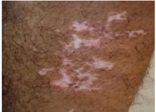
Post treatment photograph