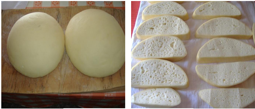
Figure 2: Ripening and salting of Bieno cheese (seria B)