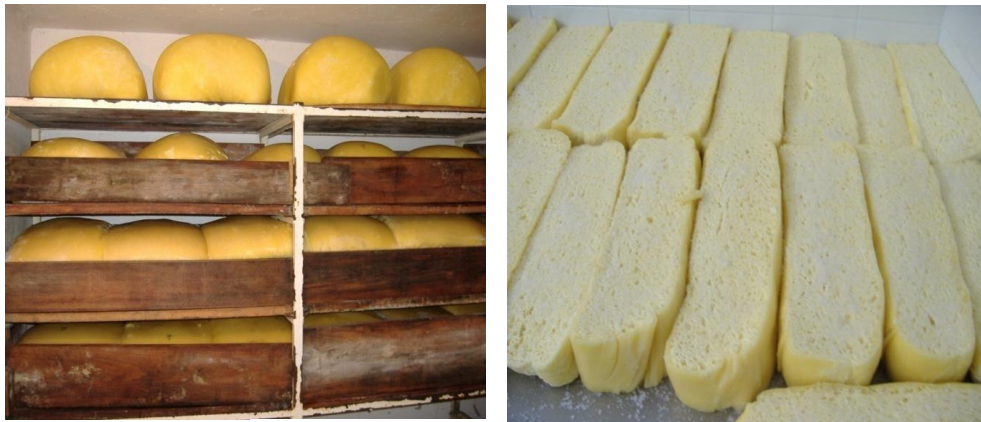
Figure 1: Ripening and salting of Bieno cheese (seria A)