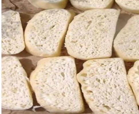
Figure 3: Ripening and salting of Bieno cheese (seria C)

The samples of cheese from the production series A, B, and C after the 45th day in brine, were taken to determine the microbiological quality and sensory evaluation.