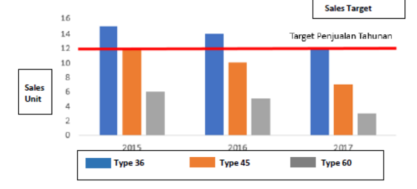
Figure 1: Housing Sales Data of PT Graha Wisma Sentosa Jaya

The growth of the property business in Indonesia, especially in big cities, is currently experiencing a significant increase. The Property Index notes that the national residential property supply in 2018 has increased by 8.1% when compared to 2017. PT Graha Wisma Sentosa Jaya is doing its business and is optimistic about seeing the property market stretching in Sunggal District, especially in line with the economic growth in Deli Serdang, before PT Graha Wisma Sentosa Java wants to build a residential area in the Sei Mencirim area. However, the managing director of PT Graha Wisma Sentosa Jaya stated that in the last 3 years, the residential sales target was not in accordance with the target set by the company, namely at least 1 house must be sold per month.