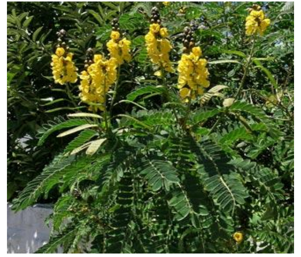
Cassia didymobotrya Fres. shrub

when its secondary metabolites are abundant.<sup>[16]</sup> Identification of the plant was done in the field and laboratory by a plant taxonomist from the department of pharmaceutical pharmacognosy and chemistry in Kenyatta University, after which a voucher specimen was deposited in the university's herbarium.