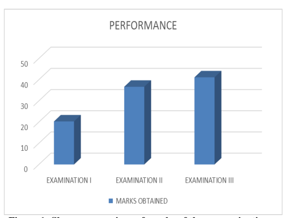
Figure 1: Shows comparison of marks of three examinations.

Results showed no significant difference in marks obtained by the two groups. P-value < 0.05 * (significant) P-value < 0.01 ** (highly significant)