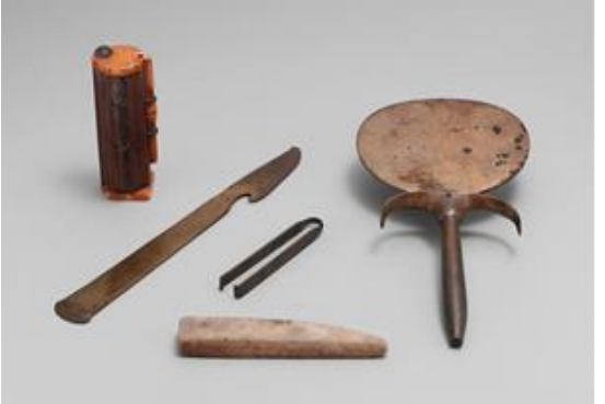
Cosmetic implements including a kohl tube, a razor a whetstone a pair of tweezers and a mirror