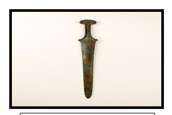
Sword made of Copper Alloy British Museum, UK

examples. Kohl, a cosmetic substance mostly composed of charcoal, galena, and malachite, was historically utilized for application around the eye, resembling contemporary practices of using eye-liner and eye-shadow.[31] Jewelry, like to other luxury commodities, predominantly comprised of valuable materials, with gold being particularly prominent in ancient Egypt. Copper ores, as well as copper and bronze, were employed in the production of jewelry. Malachite, azurite, and turquoise were highly sought after due of their vivid hues. Tiny fragments of these minerals have the potential to be embedded within ornamental components and objects, with the purpose of imparting vibrant hues. [32] Copper ores were widely utilized as a pigment in the New Kingdom for the purpose of coloring paints, glazes, and cosmetics