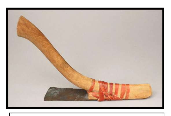
Metal adze blade attached to a wooden haft Met Museum of Art, New York