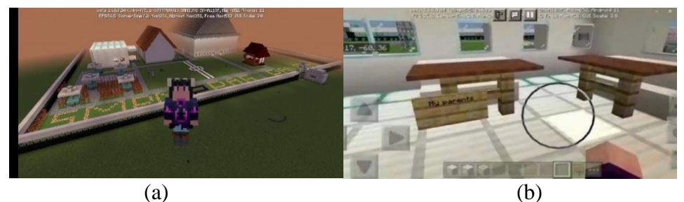
Figure 2. The layout examples of building in the Minecraft world includes: (a) the school building, (b) school canteen.

Minecraft World with some rooms. Also, below is the Minecraft world layout that supports the gamified learning activities in the worksheet.