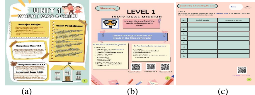
Figure 1. The prewriting stage includes: (a) preliminary page, (b) observation instruction page, (c) questioning and collecting the data page.

of the prewriting stages presented into preliminary pages, observing instruction pages to explore Minecraft world, and questioning & collecting the data pages. The layouts of prewriting stage can be seen as follow.