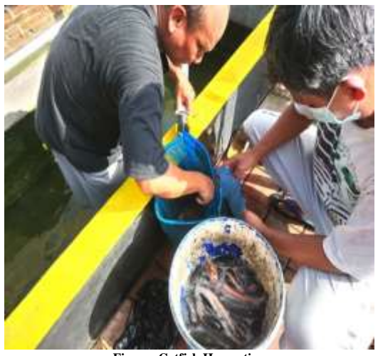
Figure: Catfish Harvesting

Productivity of vegetables in the urban farming group of Mina Garden Spirit is not as much as KWT Puspitasari where the Mina Garden Spirit Group still produces the crops for their own consumption. However, the Mina Garden Spirit Group has superior productivity in the field of fisheries, namely catfish cultivation. Harvesting catfish is relatively fast, which is around 2.5 months to 3.5 months. The harvest cycle depends on the quality of the seeds used, the better the quality of the fish seeds, the faster the harvest cycle. Good seeds are usually 5-7 cm in size so the harvest cycle is fast.