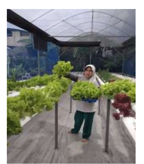
Figure: Vegetable Harvesting by KWT Puspitasari

The vegetable harvested from KWT Puspitasari are sold in the surrounding area or consumed by the management themselves. Vegetable production in this urban farming group in one week can reach twenty kilograms. Meanwhile, in the Mina Garden Spirit Group, the harvest has not yet reached the stage of selling crops. Vegetable yields in this group are still at the consumption stage for the management of this urban farming group. This is because productivity is still limited and land has not been maximized.