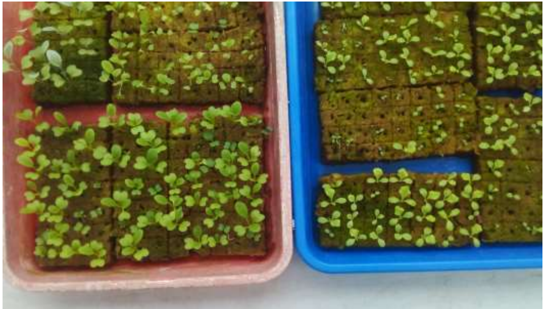
Figure: Seeding done by the Women Farming Group (KWT) Puspitasari

before the plants are planted in the planting area. The initial seeding is in collaboration with the Department of Agriculture as the supplier of plant seeds. The department only facilitates it at the beginning, whereas once urban farming is underway, they must be able to produce independently. Seeding is a very important process to get good plants, hence the seeds used must be good. The plant seeds used will affect the quality of the plants produced. The farming group in Sampangan Sub-district, KWT Puspitasari to be precise, can produce their own crop seeds.