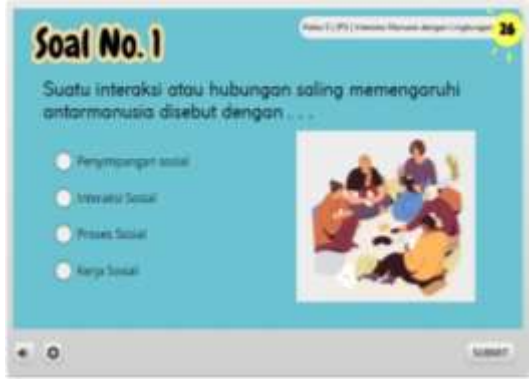
Figure 7. Question

Storyline-based Articulate e-module teaching materials, the final product of the research, have been validated and revised according to suggestions and input from teachers. experts. and students. Storyline-based Articulate e-module teaching material has been tested. It is suitable for use as a support and support for social studies learning resources in class V SDN Sukorejo 02 at KD 3.2 Analyzing the forms of human interaction with the environment and their influence on the social, cultural and economic development of Indonesian society and KD Presenting the results of an analysis of human interaction with the environment and its influence on the social, cultural and economic development Indonesian of society.