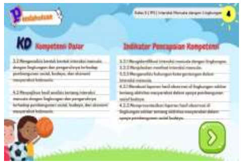
Figure 4. Learning Target