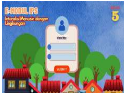
Figure 2. Entry Page