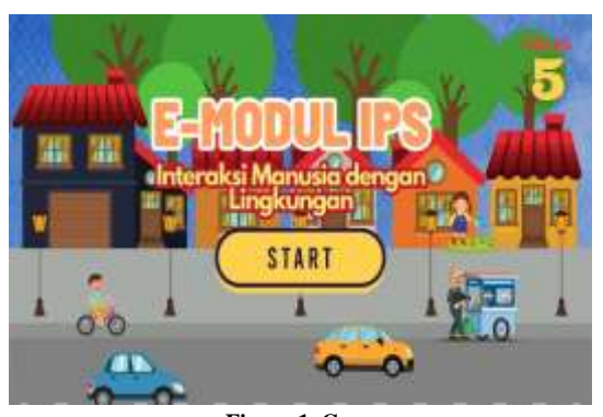
Figure 1. Cover

competencies, indicators, and learning objectives. For more details, the following media product designs developed by researchers are presented.