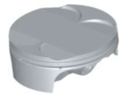
Figure 1. Piston for KTM 450 motorbike engine.

efficiency that have challenged the designers to further push the performance envelope for many engine components. The solution was found in mass reduction of key engine components coupled with higher service temperatures [2]. Improving the efficiency of an internal combustion engine has somehow necessitated the improvement in piston (Figure 1) [3]. Piston works in high pressures and temperatures compared to other engine components and being exposed to some serious mechanical and thermal loading [4]. To withstand these loadings, a piston needs a robust design as well as material with good mechanical properties.