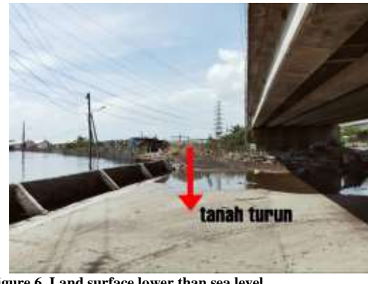
Figure 6. Land surface lower than sea level

In early 2020, there was a high tidal wave, the location that was inundated was around Tambakrejo Street under the flyover (Figure 6), because the ground surface was lower than the sea level so that road access was disrupted.