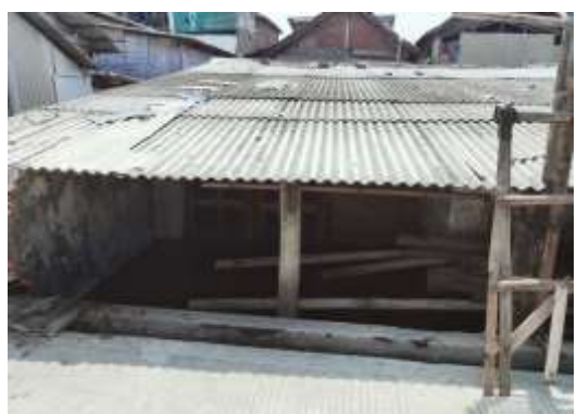
Figure 5. Respondents drowned houses

Rob that occurred in the research location area has been a long time ago, many respondents said that rob occurred since they settled and lived in the area, in the 1990s, but the rob conditions are getting worse at this time, there are houses that are submerged and finally abandoned by their that is owners because of the rob increasingly eating land. but some fishermen families who have economic limitations choose to build makeshift houses in a location that is not much different, this makes the community adapt by making the floor of their house quite high from the ground.