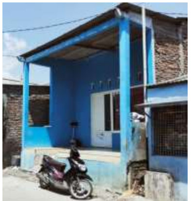
Figure 4. The foundation of the house is higher than the ground.

Evacuation shelters are prepared for people who do not have a place to go during an emergency. Related parties such as BPBD prepare evacuation sites and aid distribution. Another readiness to deal with tidal flooding by the people of Kelurahan Tanjung Mas is increase the height of the house foundation (Figure 4).