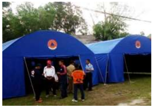
Figure 3. Evacuation sites during an emergency

Planning for evacuation is carried out by the community by planning to go to a safe place or to relatives. Evacuation and evacuation shelters are prepared by relevant parties to minimize casualties during emergencies (Figure 3).