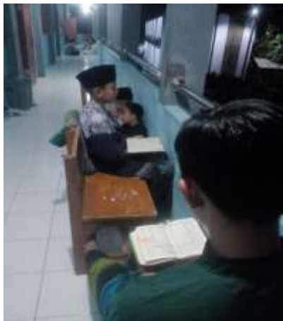
Figure 2. Peer education class of Silsilah Quranuna

Applied the peer education method of the Silsilah Quranuna, students can be monitored more directly with the help of DTQ students as tutors in their groups. Updates regarding the development of class VII students can be known directly during class sessions with DTQ students. In everyday (Monday-Friday), DTQ students hold class briefings and provide updates about DTQ or the development of class VII students. This makes it easier for the DTQ project officer, as PIC teacher who