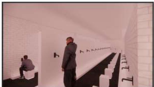
Figure 5. The toilet of mosque

The figure above shows the design of the mosque in the Living Lab Glugur Rimbun Kecataman Kutalimbaru which has been made by the author so that the Living Lab area is perfect in accordance with the activity plan and function. The toilet of Mosque.