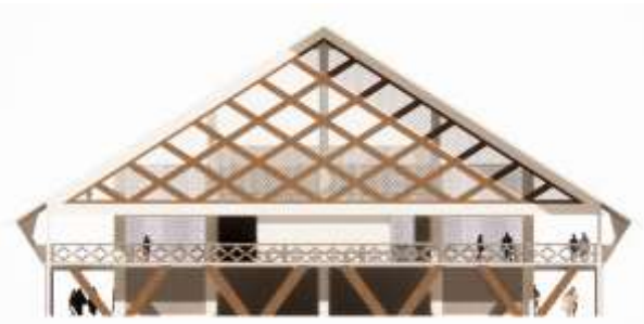
Figure 2. Front and back of the Mosque

The architectural form of the mosque can be seen from several approaches, such as the populist approach of revivalism, namely the application of architectural elements of the past, the heyday of Islam. Second, an eclectic approach that mixes two or three architectural styles. Third, the regionalism approach in which the architecture of the mosque represents the environment and socio-culture of the local region. Fourth, a metaphorical approach that displays architecture with symbolism that represents Islam. Fifth, a structural approach that displays structural elements as aesthetic.