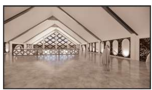
Figure 4. The interior of mosque

The figure above shows the design of the mosque in the Living Lab Glugur Rimbun Kecataman Kutalimbaru which has been made by the author so that the Living Lab area is perfect in accordance with the activity plan and function. The interior of Mosque.