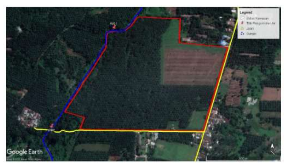
Figure 1. The location of Living Lab Glugur Rimbun, Kutalimbaru

Keras Surbakti (Kewedanaan Deli Hulu) continued until the abolition Kewedanaan Deli Hulu area in 1957. After Abolition of Sovereignty then the status of the Government changes back District with District Kutalimbaru Capital who domiciled is in Kutalimbaru Village.