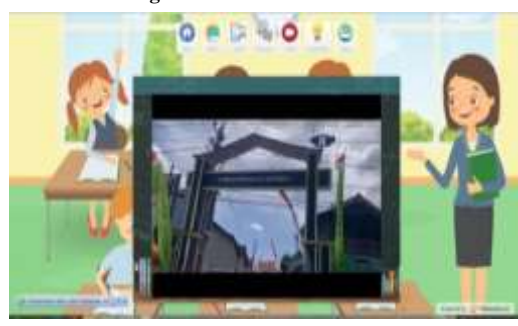
Figure 3. Local Wisdom Video

Electronic book learning media based on local wisdom to improve reading literacy to find out the validity of the material and media is tested for validity. The validity test was carried out on material experts and media experts. The purpose of doing validity is to know the quality of the media being developed besides that to find out the deficiencies in the material and the media presented. The following are the results of material validation and learning media experts.