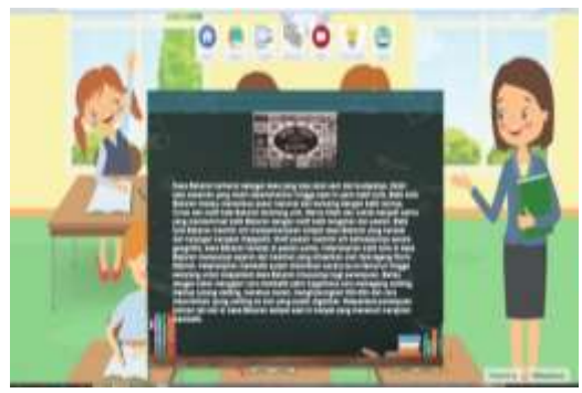
Figure 1. The material presented

Figure 1 is the material presented in the electronic book media that tells the story of local wisdom in the Juwana sub-district. The objective of the material is to use local wisdom so that students maintain the local wisdom in their environment. In addition, the material presented is so that students can improve reading literacy. The next characteristic development is the E-book which is presented as shown in Figure 2.