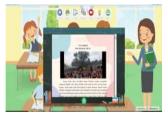
Figure 2. E-book material

Electronic book based on local wisdom tells the story of Nyai Sabirah, Bakaran Wetan Village. The role of understanding reading literacy in one story adapts social studies material to local wisdom in the students' environment in Pati district. Furthermore, media development includes local wisdom videos. The purpose of presenting the video is to maximize learning objectives teachers in conveying messages and subject matter to students so that messages are easier to understand, more interesting and more fun for students.