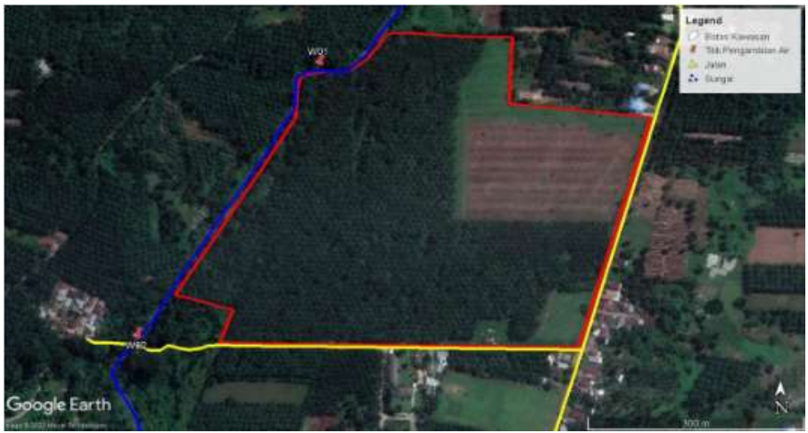
Figure 1. The Research Location

Program, Panca Budi Development University. This study is a qualitative descriptive analysis. Data collection techniques are with a qualitative approach, so the data collection techniques used by the author in this study include: (1) interviews, (2) literature studies, (3) field observations, (4) documentation, (5) data validation, (6) data analysis.