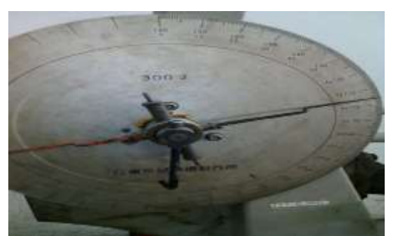
Figure 8. needle observation after test

After the pendulum is dropped and has hit the impact test material, attention should be focused on the direction of the needle which should lies with the existing values so that calculations can be carried out on the impact test formulas (Fig. 8)<sup>[10]</sup>.