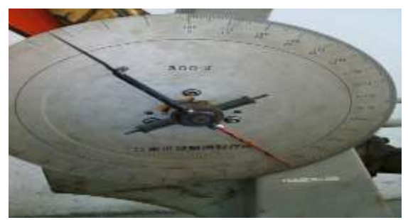
Figure 6. Needle setting at impact rating

The impact of material test is installed snugly and the needle must be set first to a value of 0, as shown in Fig. 6^{[8]} .