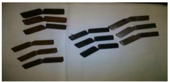
Figure 9. Impact test material after testing process

After the testing process finishes, the impact test material is analyzed to see whether the test material is broken or not (see Fig 9)<sup>[11]</sup>.