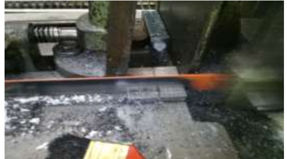
Figure 2. Cutting process of AISI 1045 steel

The AISI 1045 steel is initially cut using an iron saw and the process can be seen in Fig. 2.