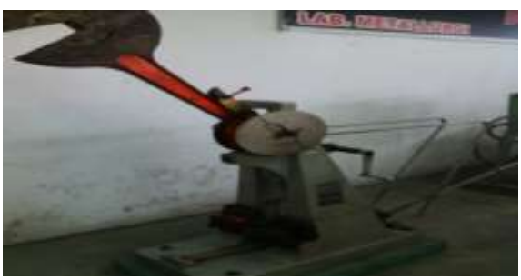
Figure 7. Hitting process of impact test material

The pendulum is released or dropped to strike the impact test material snugly in the notches made to be struck in the impact test material (see Fig. 7)<sup>[9]</sup>.