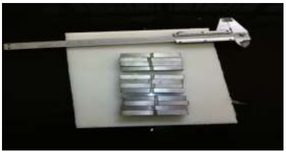
Figure 4. Material measurement of impact test

First of all, the impact of material test for DIN 2344 steel is measured in advance for the thickness, width and length of the material as shown in Fig. 4^{[6]} .