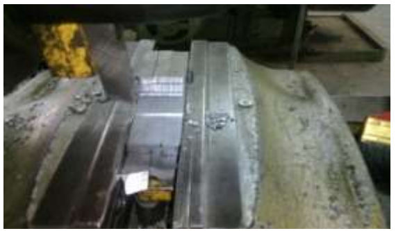
Figure 3. Scrapping process

Steel previously cut with a saw machine is then scraped with scraping machine to get a predetermined size (see Fig. 3).