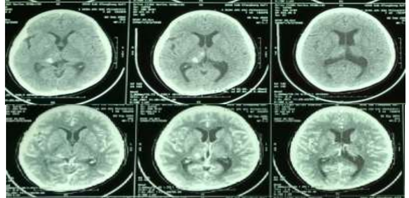
Figure 1. Head CT scan

Initial laboratory evaluation revealed a white cell count (WCC) of 8.4×109 cells/L with neutrophilic predominance (6.19 \times 109) cells/L), normal eosinophil count (0.08×109 cells/L) and normal basophils count (0.04×109 cells/L). Haemoglobin was 12.9 g/dL, sodium 140 mmol/L, serum creatinine 0.64 mg/dL and urea nitrogen was 13 mg/dL. Chest X-ray and electroencephalography study were normal. The patient refused to receive a lumbar puncture. An initial head CT contrast revealed abnormal hyperdense lesion with multiple calcification density in the right thalamus with the largest size being 1.2 cm which looks stung with contrast enhancement.