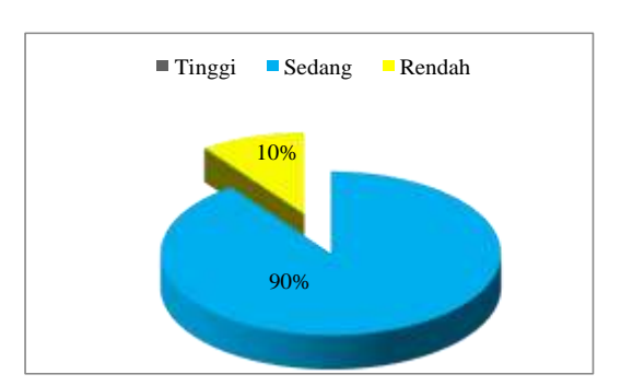
Figure 3 N-Gain Experiment Class Learning Achievement

Based on the data in Table 3, it can see that the average N-Gain student achievement shown a result of 0.45 which is in the medium category. The results of the N-Gain calculation for each student can see in Figure 3.