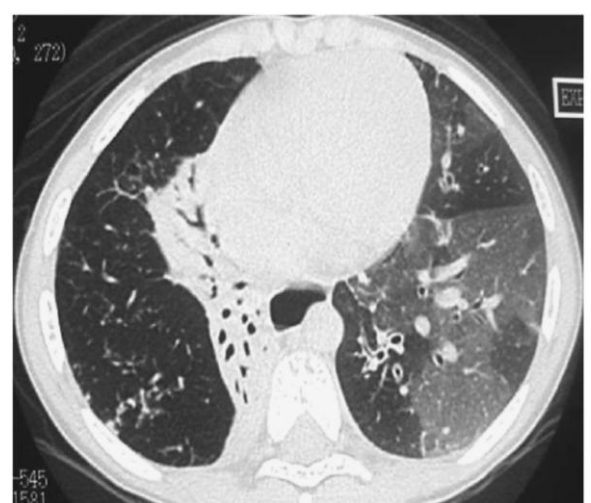
Fig 2: CT film of the child: Bronchiolitis obliterans