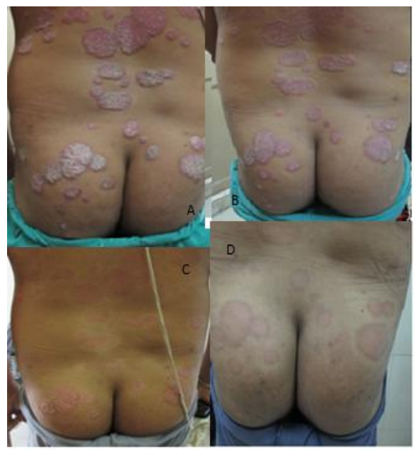
Figure-1 Serial picture of improvement. A. 0 week, B 4 weeks, C.8 weeks, D. 10 weeks

There is marginal difference of result in male and female [Graph-1].