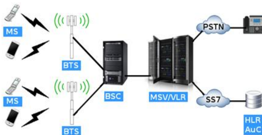
Figure 1 : Basic Structure and Component of Mobile Network

between the nodes. When the communication between two nodes is performed, lot of other nodes act as the intermediate nodes. The network communication and route optimization can be applied in this network form to optimize the communication strength. The basic structure of mobile network is shown in figure 1.